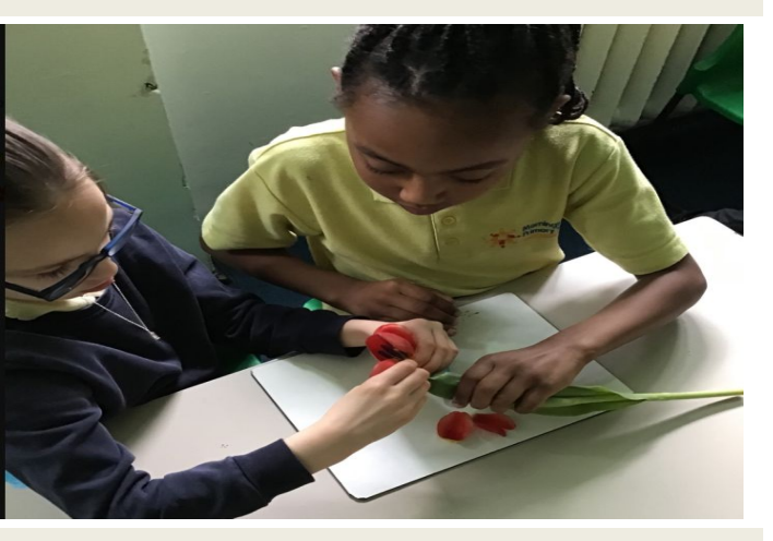
Year 3 have been dissecting flowers to identify the different parts. We learnt about the filament, anther as well as the functions of roots.

In Year 5 this week they have written some fantastic persuasive pieces of writing about how we can protect the environment in Hackney. They used their oracy skills to publish their writing, sharing it with their classes.