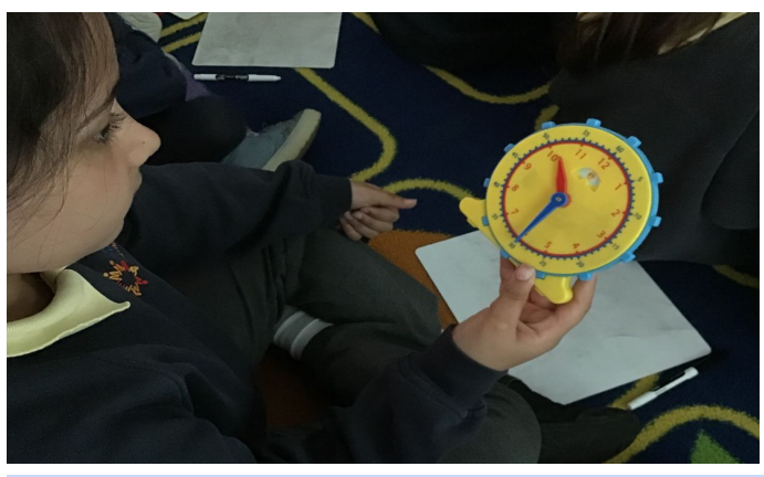
Year 2 have been practising telling the time to the hour and half past the hour.