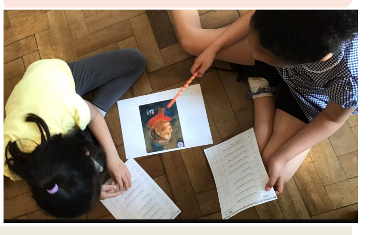
Year 1 have been analysing different sources in history to find out information about Mary Seacole.

We all have a voice. We can use our voice to choose our favourite song in the Eurovision Song Contest. We may even cast a vote!