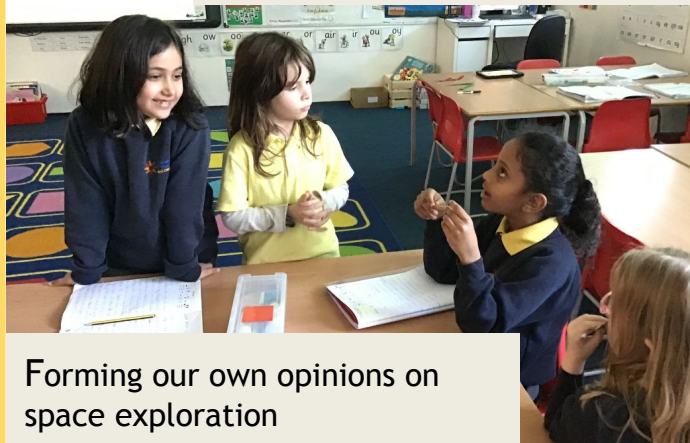
Forming our own opinions on space exploration

In assemblies on Friday we celebrate all of the children. There are awards for different areas of the curriculum and Stars of the Week certificates for children who are consistently observing our 3 school rules and being READY, RESPECTFUL and SAFE . Photos of certificate winners are shared on our website, on Instagram and on Twitter each week