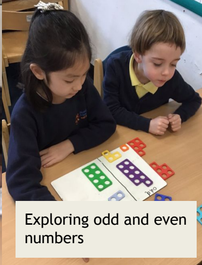
Exploring odd and even numbers