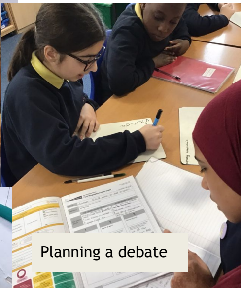
Planning a debate