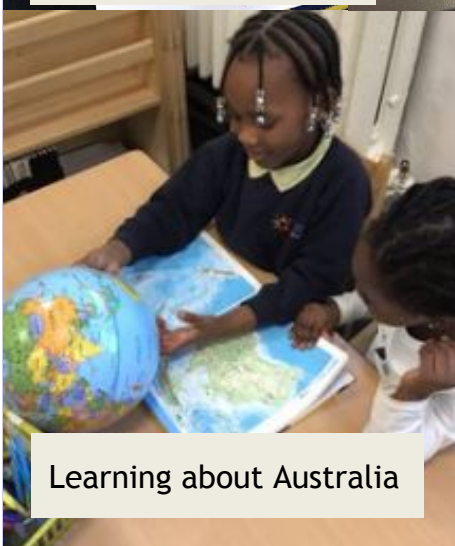
Learning about Australia