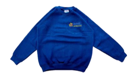
Navy blue sweatshirt or jumper