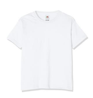
Plain white t-shirt